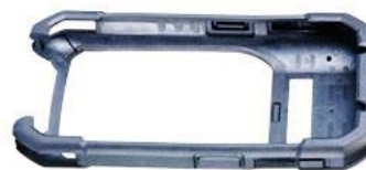
The protective boot upgrades the RS30 to 1.5m drop resistance and 500 tumbles at 0.5m.