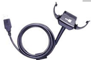
USB Snap-On cable.