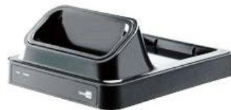
Charging cradle w/charger for spare battery.