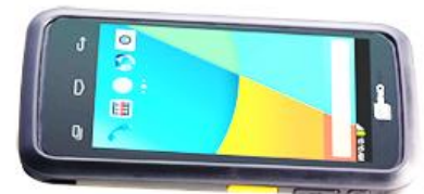
RS30 Series Touch Mobile Computer